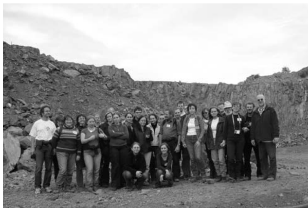
The participants of the 13th Meeting of the Petrology Group during the field trip in the active quarry at Winna Góra, near Jawor

The conference was organized very well in the opinion of its participants. It provided a review of current petrological research in Poland. The presented findings proved,