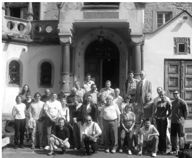
The participants of the Polish Clay Group Symposium, 2005, at Sobótka

On the evening of the first day, a meeting of the council of the Clay Group of the Polish Mineralogical Society