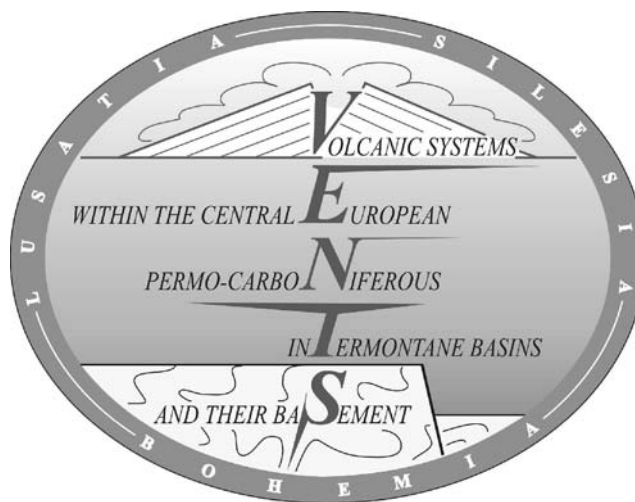
Logo of the VENTS project

The program of the workshop included three conferences with eight lectures, and three days of field trips covering 21 localities. The opening lecture by C. Breitzkreuz entitled "Permo-carboniferous volcanic and subvolcanic activity in Europe: what do we know and what do we want to know?" introduced the participants to the current issues in the research of late Palaeozoic magmatism, with emphasis on the physical volcanology and SHRIMP dating of volcanic rocks. The following lectures provided summaries of the most recent studies and results on the Permo-Carboniferous igneous complexes in the Elbe Zone (U. Hoffmann) and eastern Saxony (A. Renno), the volcanic rocks in the Bohemian part of the Intra-Sudetic Basin (V. Prouza), the Teplice-Altenberg Caldera (B. Mlčoch), the Karkonosze granite (E. Słaby), and the Żelazniak intrusion (A. Mu-