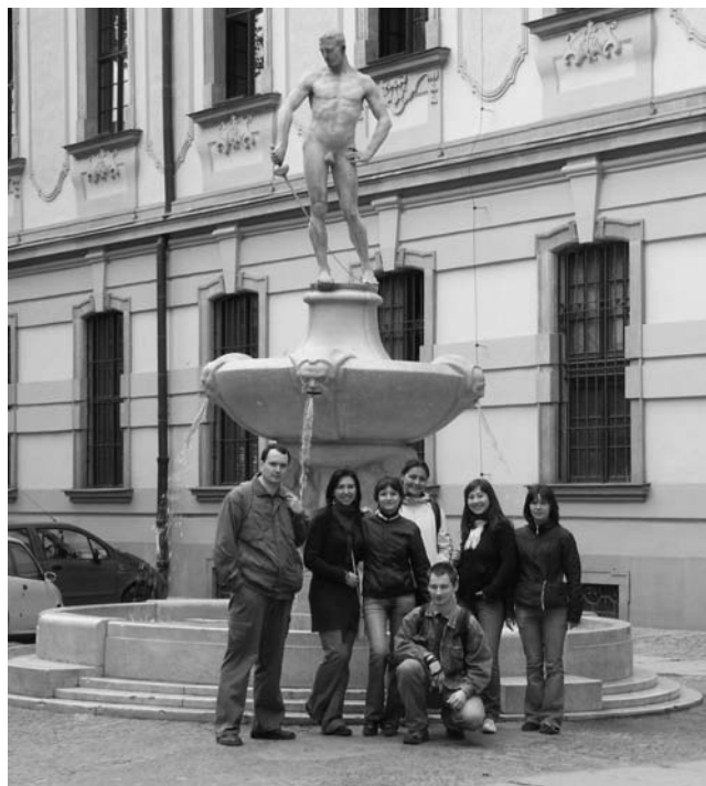
Participants of the CEEPUS Summer School in front of the Collegium Maximum of Wrocław University